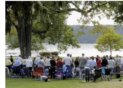
Annual Service by the Lake.

Our Sunday worship experience inspires us on our journey as followers of Christ, through the Book of Common Prayer , sacred music, and sermons which connect us deeply to the Gospel. We enjoy our active choir and music program. While we value traditional liturgies and music, we are also willing to be challenged by new ideas. We welcome newcomers, and create an environment where those of different lifestyles or faith backgrounds can come and feel comfortable worshipping together with us.