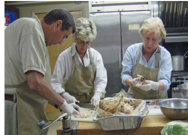
Gleaner's Kitchen volunteers at work.

We care for the hungry in our local community by providing facilities for the Gleaner's Community Kitchen, which provides a noon meal five days a week to all who come.