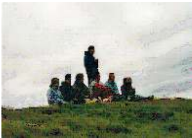
Youth on pilgrimage in Scotland.

We take our responsibility to each other seriously by participating in Stephen Ministry, a lay ministry of being the listening presence of Christ for those suffering an illness, loss, or loneliness. Through lay Eucharistic ministry, we care for our members who may be unable to attend services.